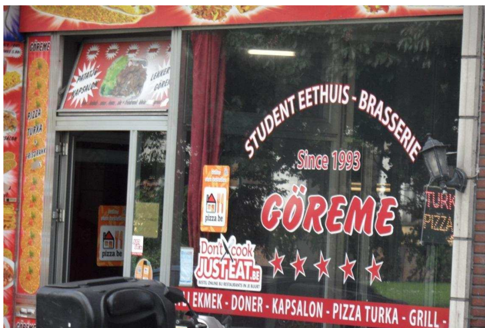
Figure 3: Göreme restaurant.

Turkish kebab restaurant Göreme at the beginning of the Wondelgemstraat also tries to cash in by explicitly focusing on the student population (Figure 3).