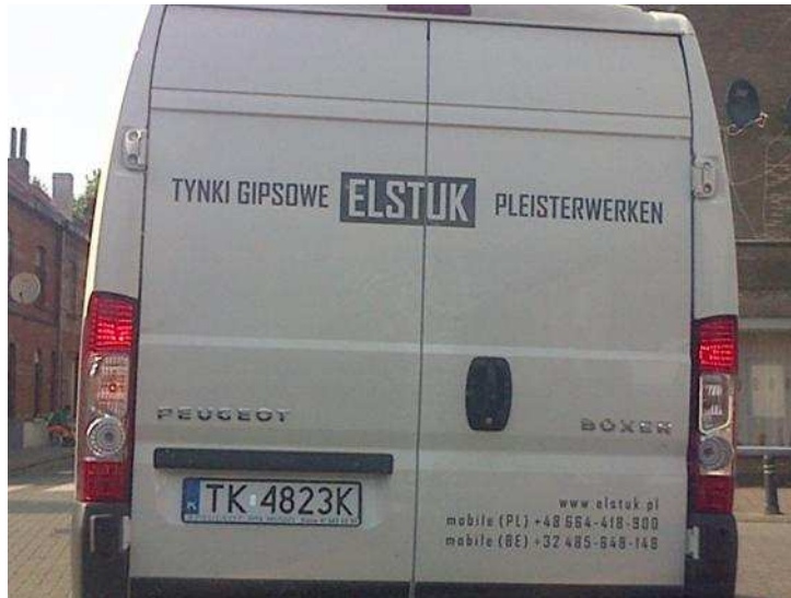
Figure 1: Polish van in Wondelgemstraat.

Rapid social and cultural change defines the superdiverse neighborhood and its permanent demographic turnover: many people move in, but as many move out of the neighborhood or change location within the neighborhood itself. We shall see more examples of this below. These rapid changes may seem chaotic, but they are patterned and ordered: the different migration waves translate in a layered and stratified district where some layers are relatively stable across time and others change rapidly.