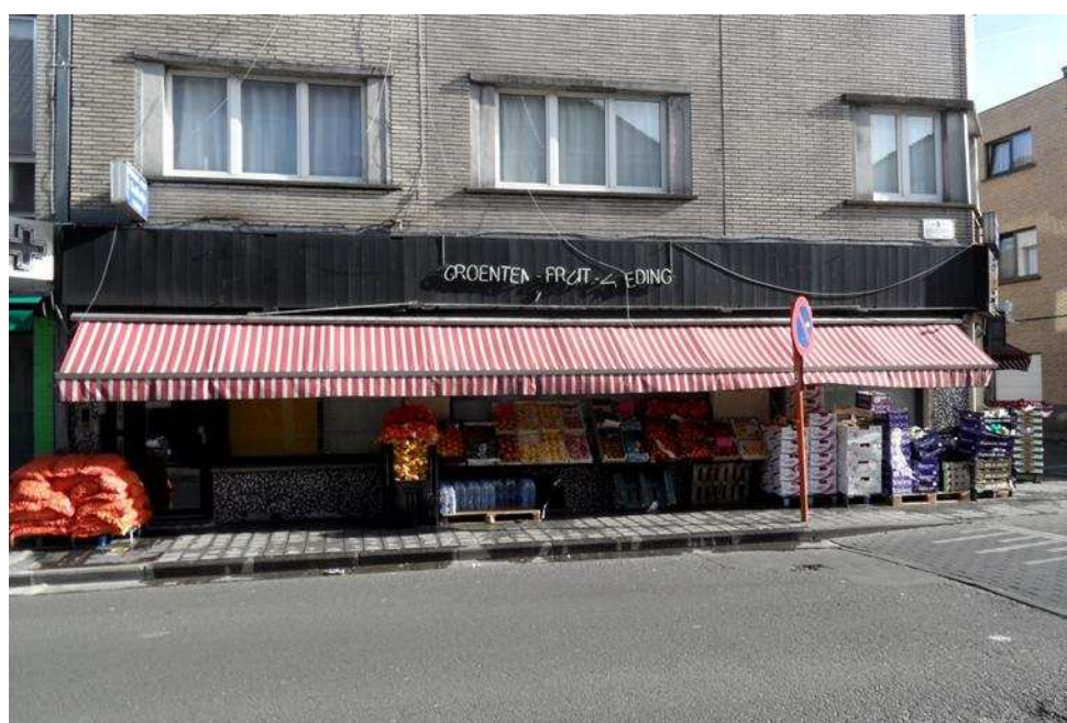
Figure 2: An image of “decline”.

We have seen earlier that Wondelgemstraat was historically a flourishing shopping street, catering for the traditional working-class and bourgeois textile workers in the area. The decline of the textile industry, together with the immigration of sizeable numbers of Turkish migrants, caused a shift in the shopping infrastructure: discontinued “native” businesses were (cheaply) purchased and replaced by new shops and bars owned by Turkish migrants and their descendants. This evolution caused a shift in the semiotic landscape, with the emergent visibility of the Turkish language and Turkish symbols (like the Turkish flag and the evil eye) in the streets. It also caused a shift in the public (i.e. “native”) perception of the street and its infrastructure: the new shops are “cheap”, and this change is perceived as a decline in status. A classic image of the decline, from a native middle class perspective, is this vegetable shop, where an older Dutch sign is still visible behind the overlay of Turkish signs.