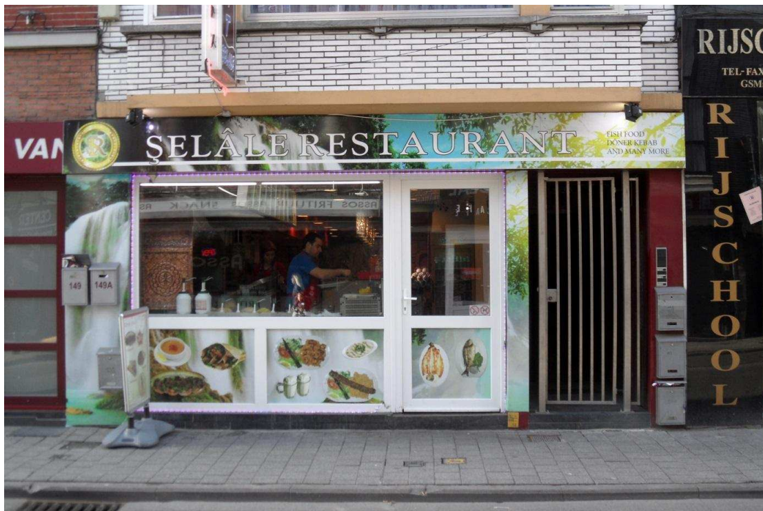
Figure 7: Selâle Restaurant.