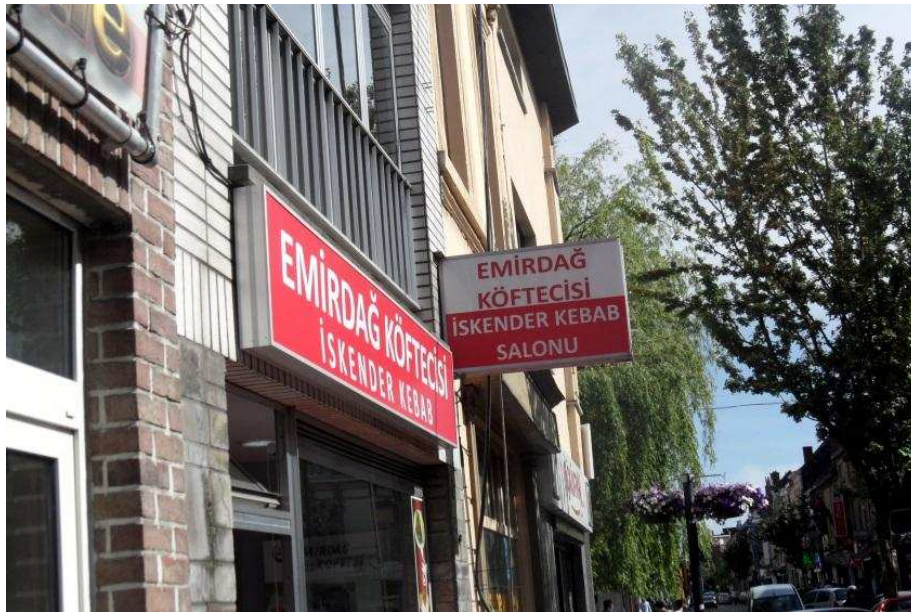
Figure 6: Emirdag Köfteçisi.

Observe, by way of illustration, Figures 6 and 7. Both pictures document a restaurant owned by the same Turkish-origin family; only, both pictures are separated by some months in which the original restaurant was closed and the new one reopened in another location. And while the original restaurant was a monolingually Turkish-language place serving home-style traditional Turkish food, the new Selâle Restaurant has a menu in Turkish and Dutch, as well as English text on its window – pointing to new middle-class and cosmopolitan ambitions and identity aspirations with its owners. Budgets and tastes move in close harmony, as Pierre Boudieu taught us some decades ago.