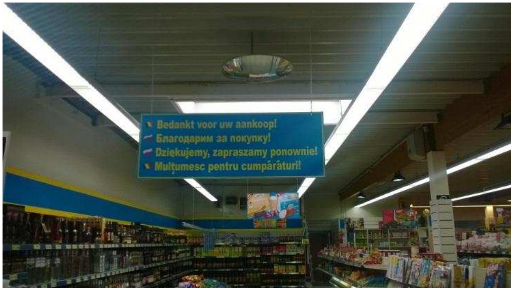
Figure 5: Mix Markt.

Other new shops appear and old ones disappear at a fast pace, each time pointing towards new forms of presence in the area. A Jordanian butcher, who explicitly advertised in Arabic to reach out to another niche of local residents than the Turkish butchers has disappeared, to be replaced by an African-Asian (Indian-Pakistani) shop that opened its doors in March 2014. A new supermarket called “Mix Markt” opened and uses four different languages to welcome and to thank its customers, namely Dutch, Russian, Romanian and Bulgarian (Figure 5).